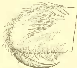
Mandible of Selenogyrus aureus , Pocock, from the inner side.